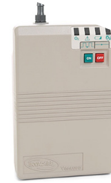
Invacare O2 Portable Device

The manufacturer has not only realized trouble free operation (reduced service calls and warranty claims) but also enjoys significant aftermarket revenue and profits on the resale of the filter units.